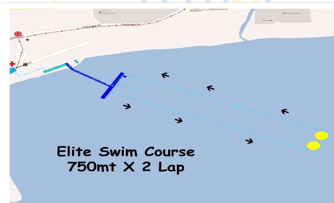
Maps No 2