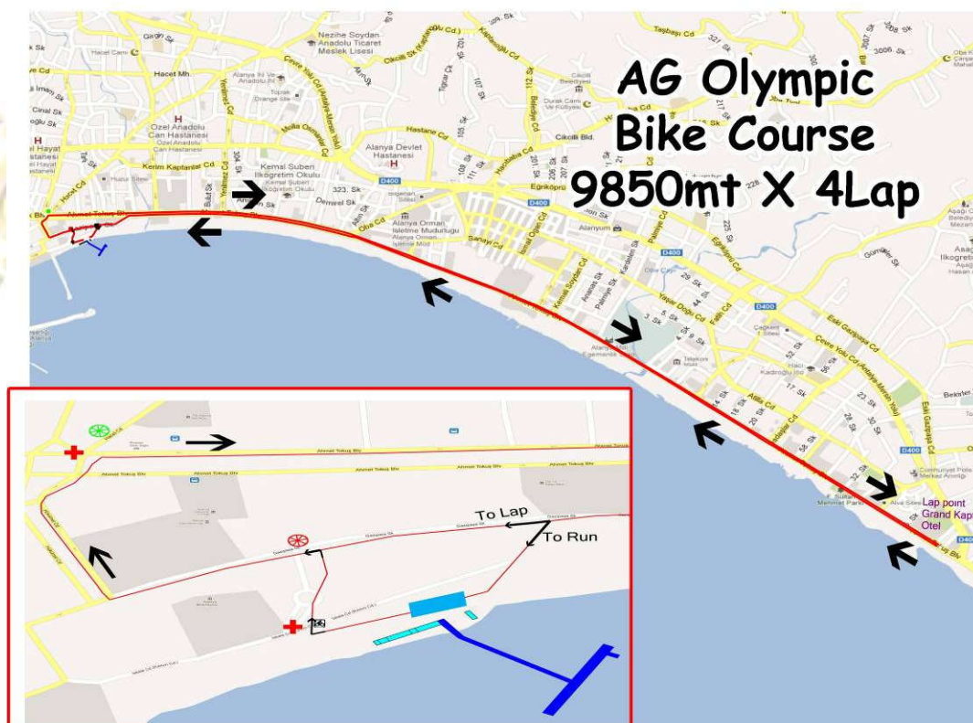
Maps No 13