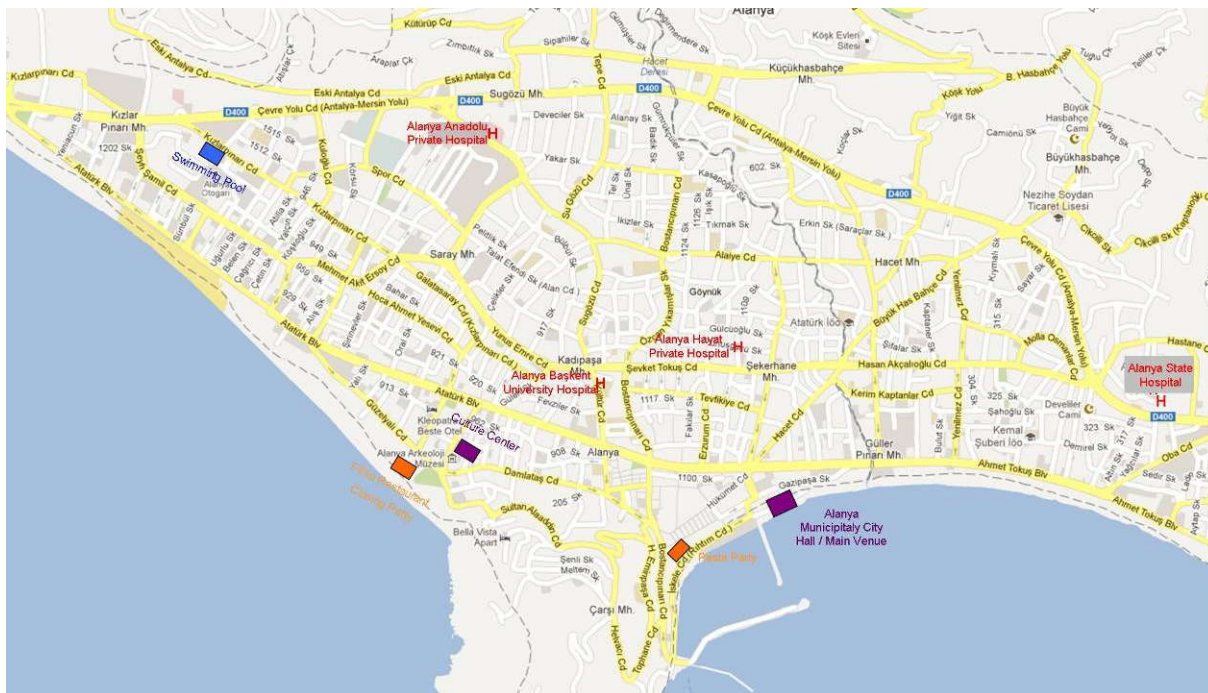
Maps No 1