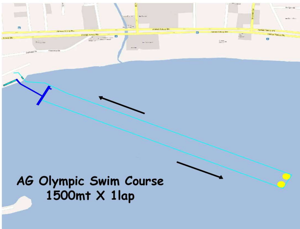
Maps No 12