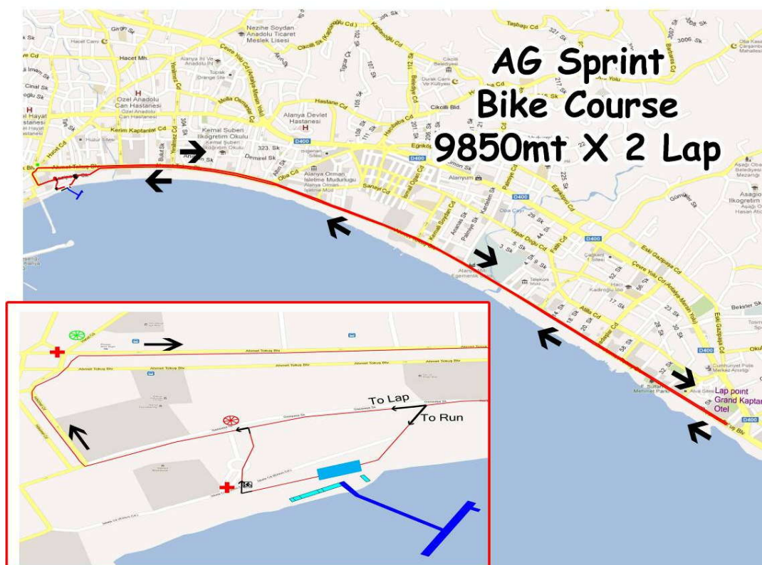
Maps No 10