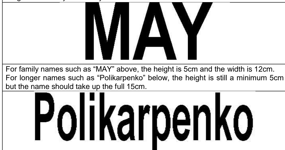
Diagram 2. Family Name Layout