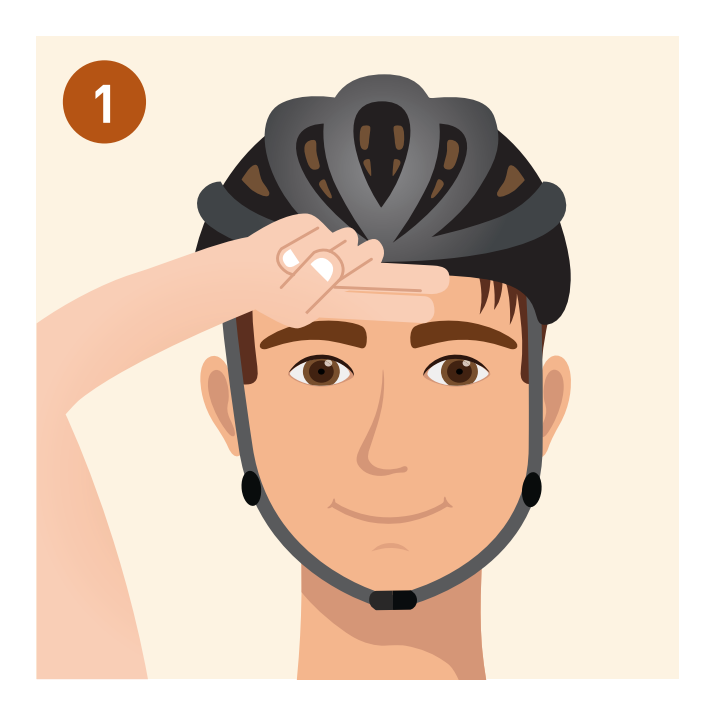
Position the helmet so that it protects your forehead. (1-2 fingers above your eyebrows).