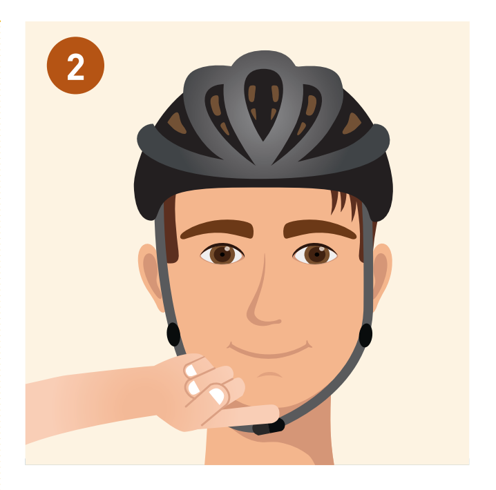
Fasten the clip on the strap under your chin. Then tighten the strap so you can still fit one finger between it and your chin to ensure it isn't too tight.