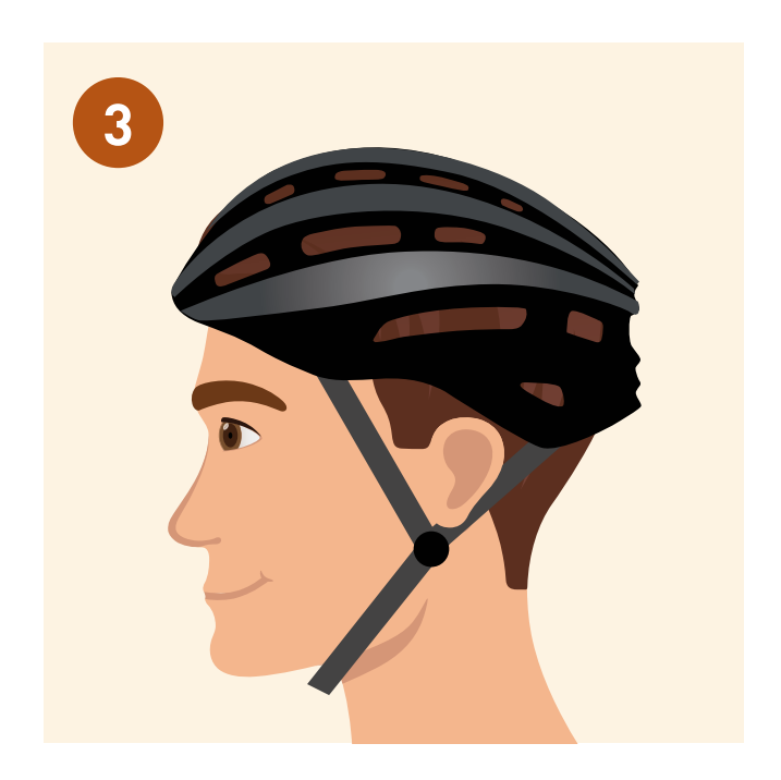
Slide the plastic clips on each side of the strap upwards so the strap forms a triangle just below your ears.