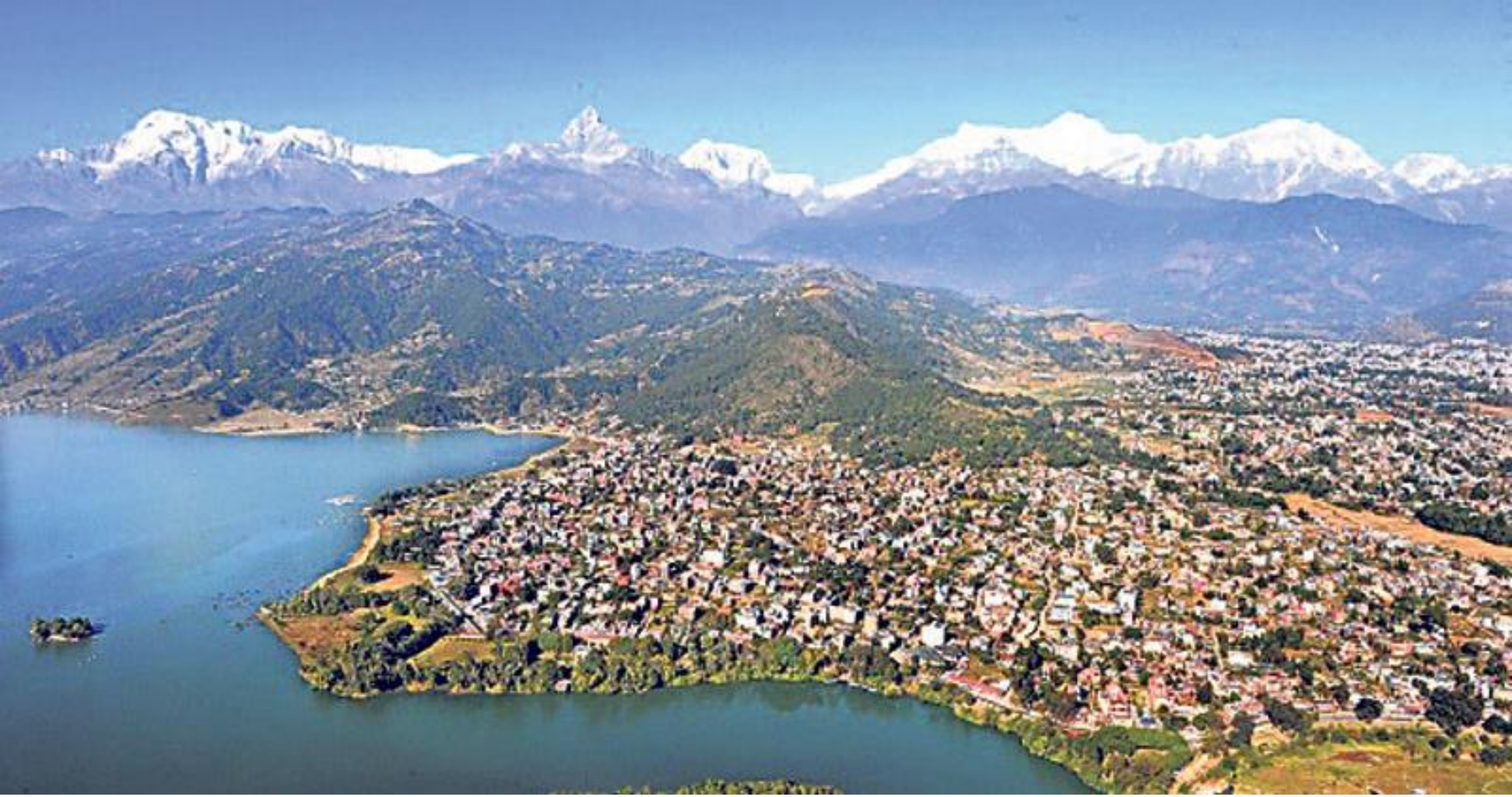
Pokhara City, Nepal