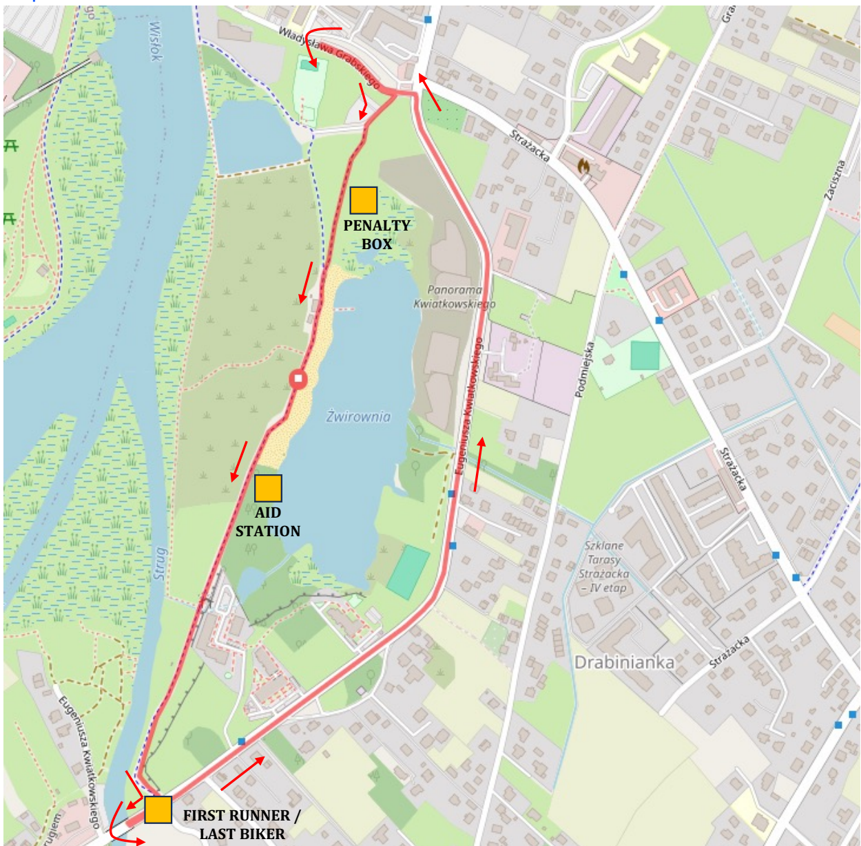
Map of the run course.